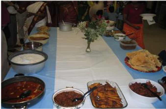
Fathers day celebration June 2007

“...nothing is better for a man under the sun than to eat and drink and be glad” Ecc1 8:15 (NIV)