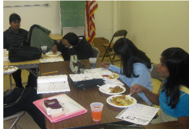
Tamil UCC youth group, January 2008

“How long wilt thou forget me, O LORD? forever? how long wilt thou hide thy face from me? ” Ps 13:1 (KJV)