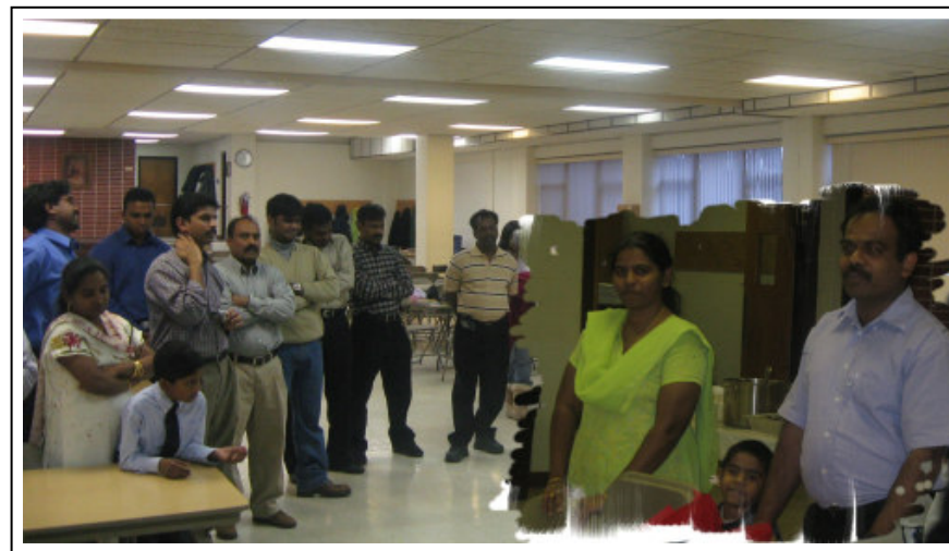
Farewell to Noels, February 2008